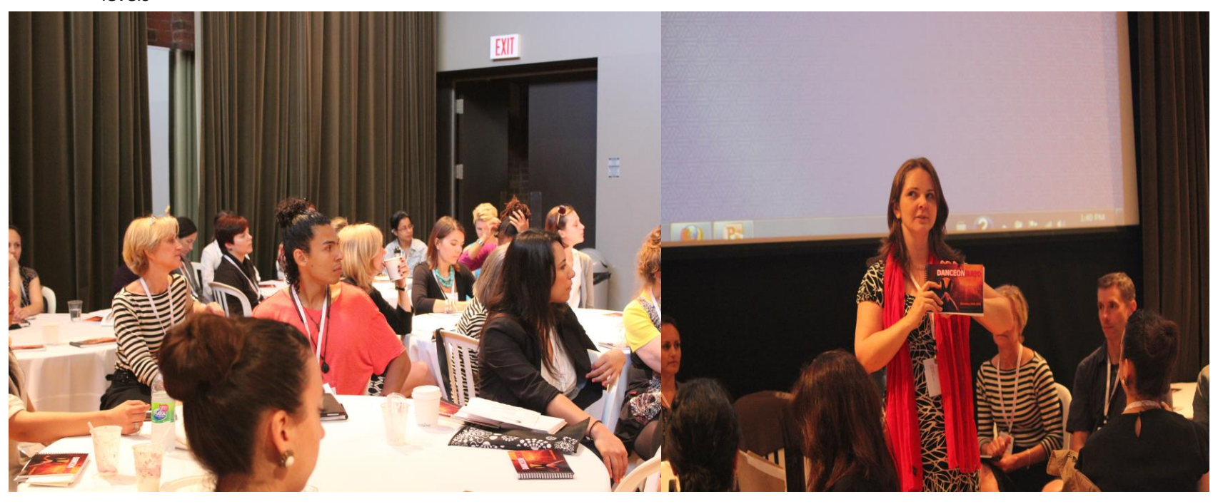
Dance Ontario then had the delegates break out by region to identify the most pressing concerns.